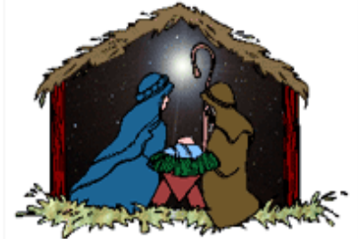
Our Lord and Savior Jesus Christ Was Born

Practices for the Children's Christmas programs start on Dec. 5 th . Practice times and dates are available in the school office. If you are able to stay with students not practicing please contact your child's teacher or school office as soon as possible.