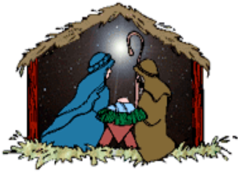
Our Lord and Savior Jesus Christ Was Born