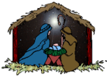
Our Lord and Savior Jesus Christ Was Born